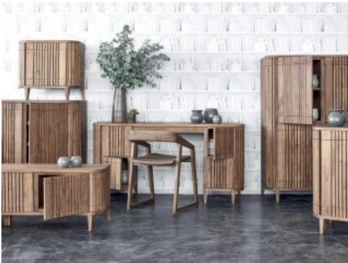
LIFESTYLE, SPOT LIGHT