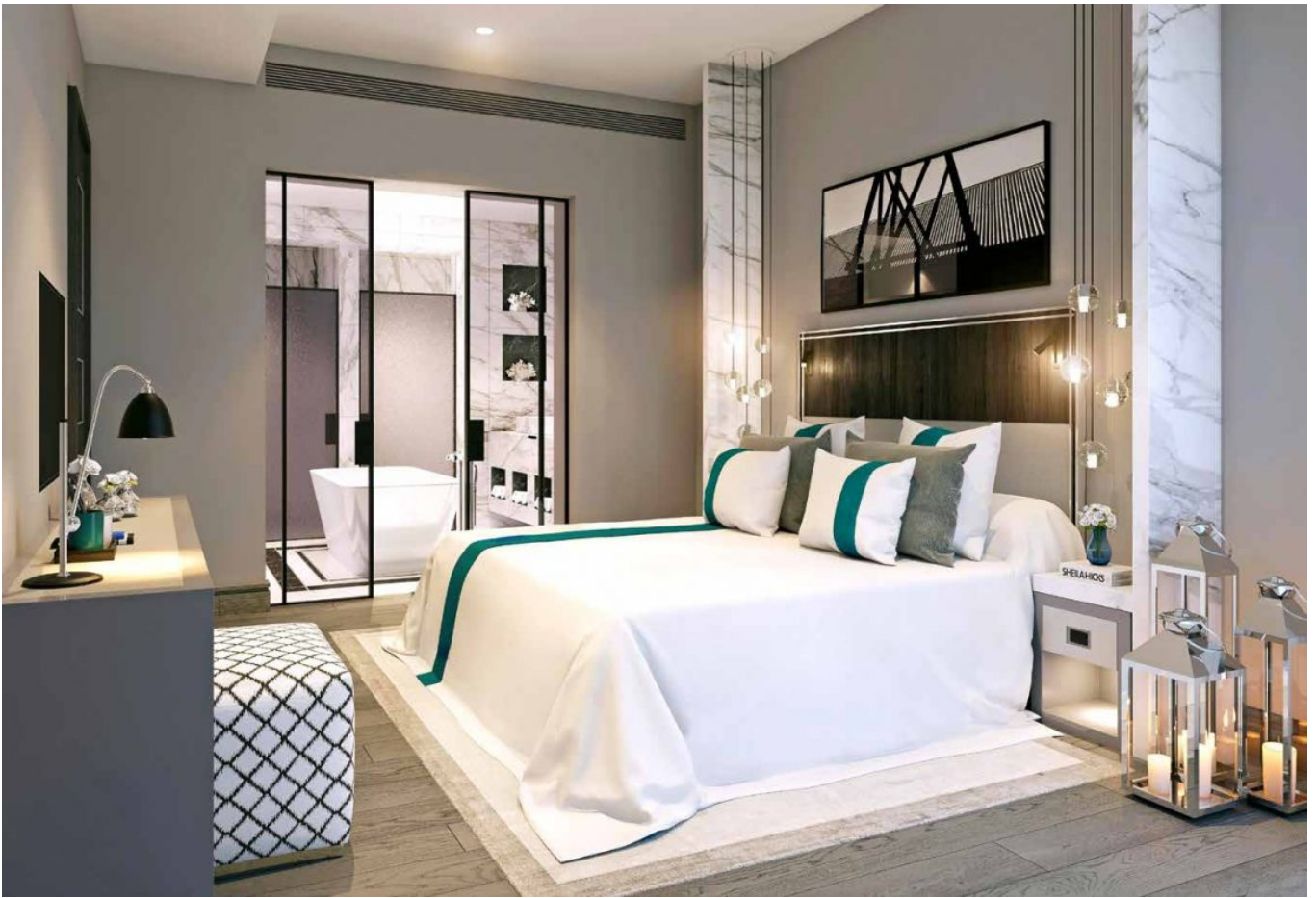
When designing the YOO8 Tower B, Kelly Hoppen seamlessly combined a sophisticated ambience with design-savvy urbanities in the city.