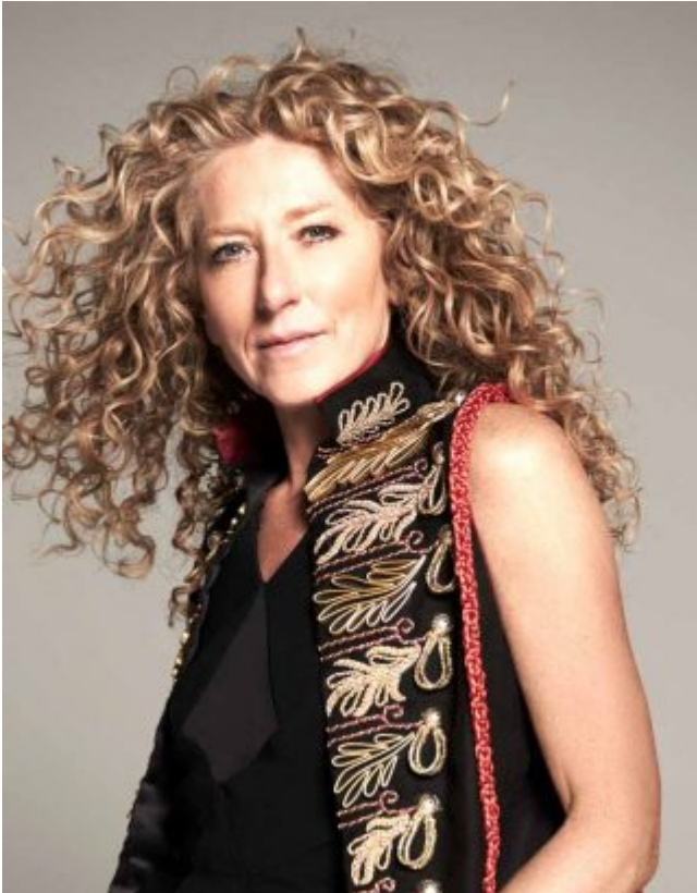
Kelly has designed homes for many high-profile celebrities and was honoured with a Most Excellent Order of the British Empire (MBE) by Queen